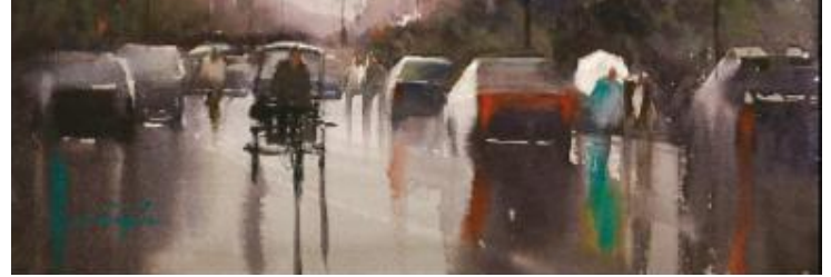
Rainy Morning, Yangshuo, China