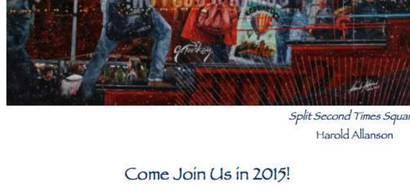
Split Second Times Square Harold Allanson